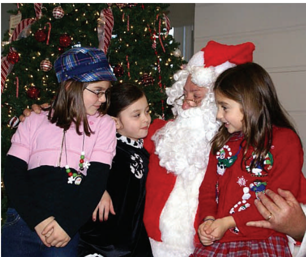
Above: 2008 Breakfast with Santa.

Neighborhood events like the annual Dinner Dance and Breakfast with Santa were opportunities for neighbors to get together, relax and enjoy the community. Last year, children at the breakfast created beautiful crafts which were donated to Meals-on-Wheels of New Rochelle for delivery with the meals during the week before Christmas. These fun events also served another purpose, to raise funds which were used for our neighborhood scholarship and beautification activities.